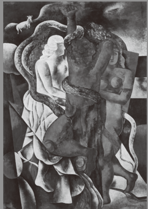
▲ KAWAGUCHI Kigai, Untitled , 1935, oil on canvas