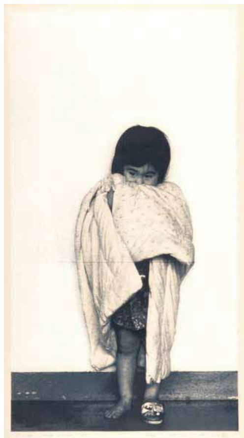
Diary: August 10, 1977 Woodblock and Silkscreen on Paper