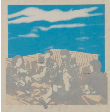
1. Diary: April 27, 1970, New York, 1970 Woodcut print, Lithograph and Silkscreen on Paper