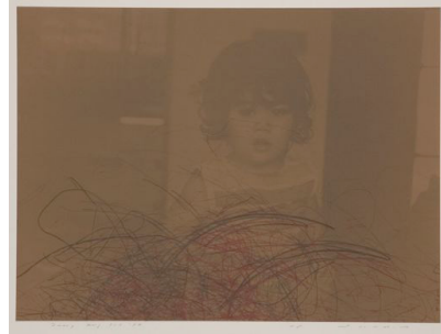
2. Diary: Augst 3, 1974, 1974 Lithograph on Paper