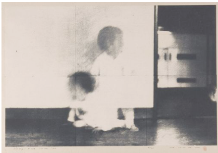
3. Diary: February 15, 1976, 1976 Woodblock and Silkscreen on Paper