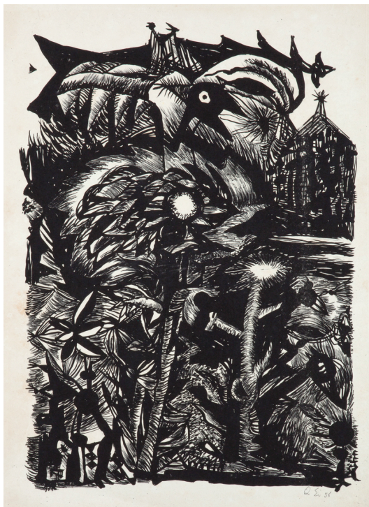
04 Back Garden , 1956, Lithograph on Paper