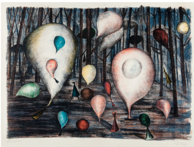
06 Traveler , 1957 Lithograph on Paper