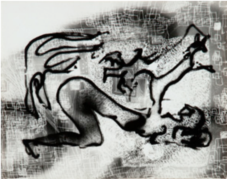
01 Dog and Woman , 1950, Gelatin Silver Print