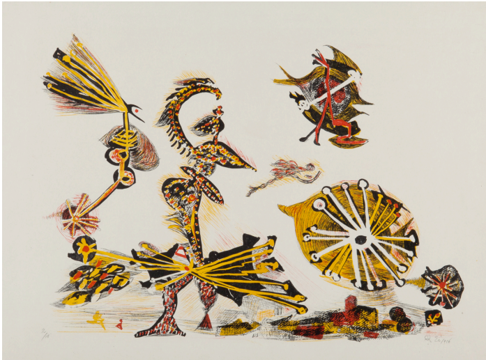
05 Play of Birds , 1956, Lithograph on Paper