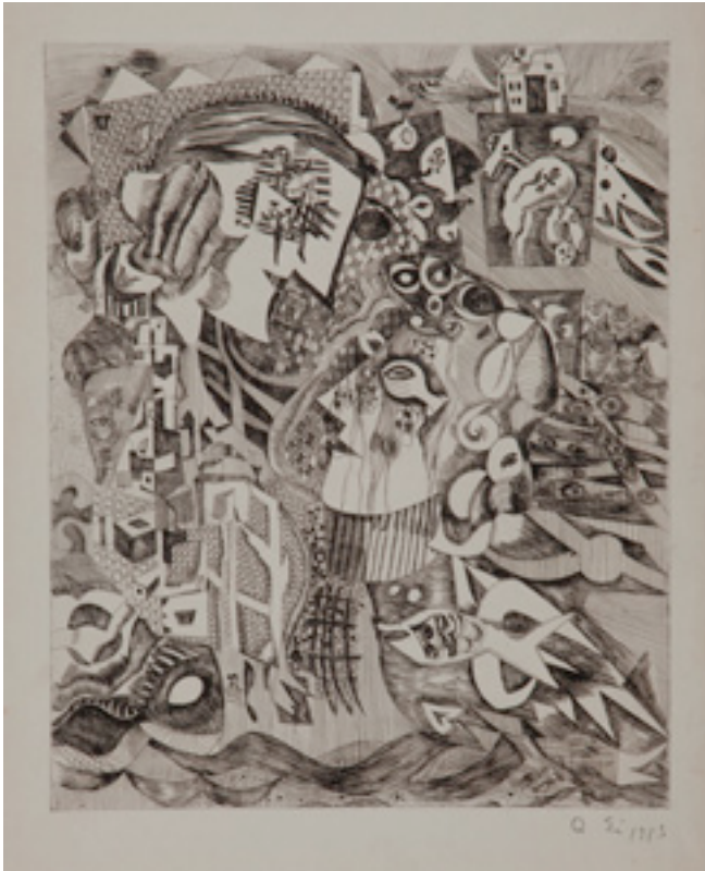
03 Mother , 1953, Etching on Paper