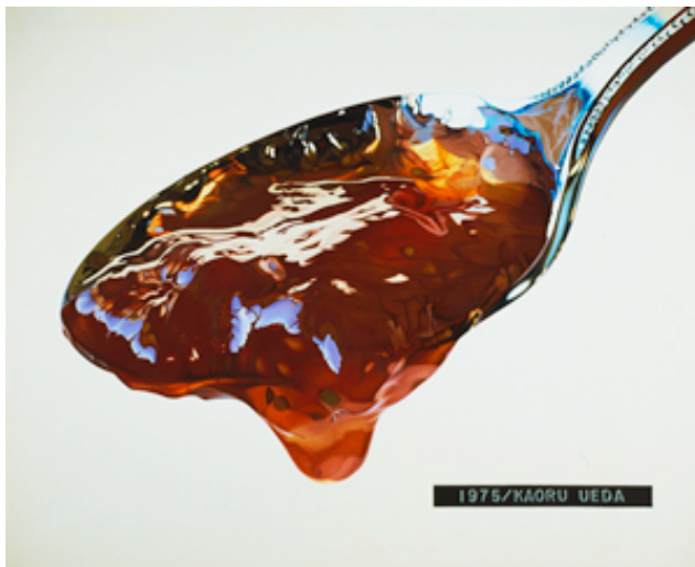
UEDA Kaoru, Jam on a Spoon B , 1975, Oil on Canvas