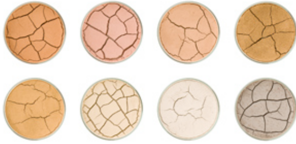
KURITA Koichi, Soil Time/ Wakayama , 2007, Soil in Wakayama in Glass Plates