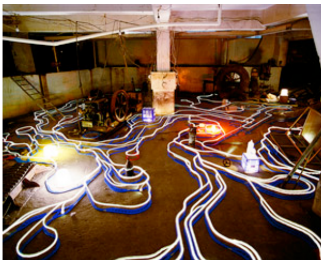
paramodel, phantom-graffiti - sawada apartment house por plant of night , 2006, Lambda Print