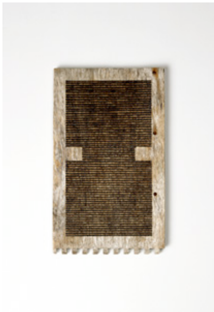
Roger ACKLING, Shionomisaki , 1996, Wood, Sunlight