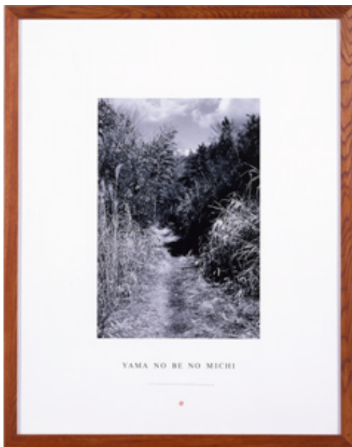
Hamish FULTON, YAMA NO BE NO MICHI , 1986, Photograph with Text