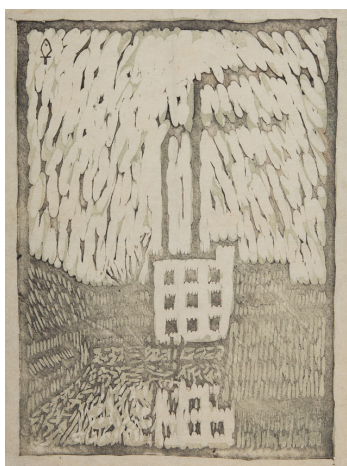
5. KAYAMA Kotori, Winter Landscape in Fukagawa , 1912, woodcut print on paper