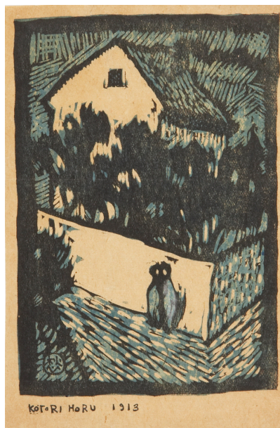
4. KAYAMA Kotori, Nostalgia , 1913, woodcut print on paper