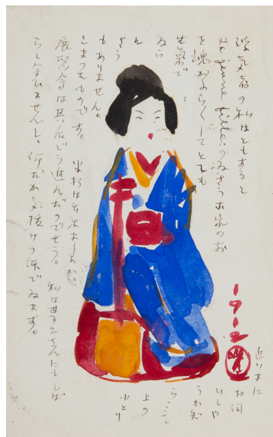
2. KAYAMA Kotori, Post Card to ONCHI Koshiro , 1912, ink and watercolor on paper