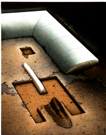
3. NAGAOKA Kunito (1940-), Homage to 6 Japanese Nobel prize winners No. 1 , 1986, Etching on Paper, 49.2 x 39.0