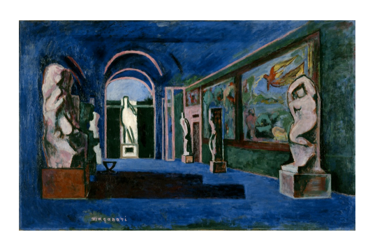
MURAI Masanari, Accademia di Belle Arti, 1934, Oil on Canvas

It is with great pleasure that we present Collections: Winter 2013/14 . The Museum of Modern Art, Wakayama, whose predecessor was the Wakayama Prefectural Museum (founded in 1963), inaugurated in the building of Kenmin Bunka Kaikan (the Cultural Hall for Citizens) in November 1970. It kept mainly forcusing on introducing artists related to Wakayama after the Meiji Restoration and started its activities anew at the current building designed by architect KUROKAWA Kisho in 1994. On the occasion of the relocation, it expanded the range of the collection, and it now holds more than 10,000-piece of works from home and abroad.