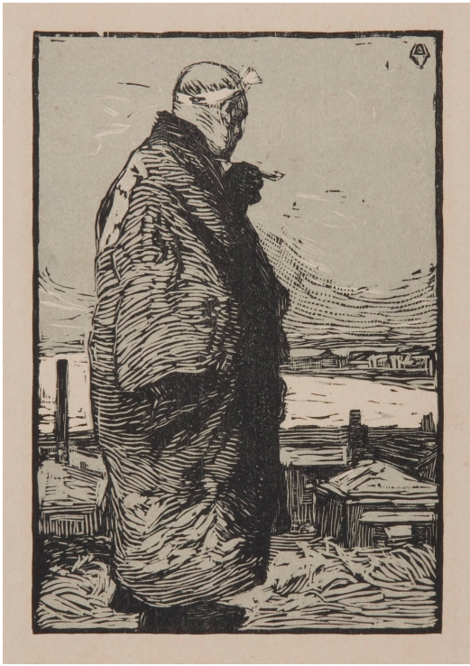
1. YAMAMOTO Kanae, Fisherman , 1904, Woodblock on Paper