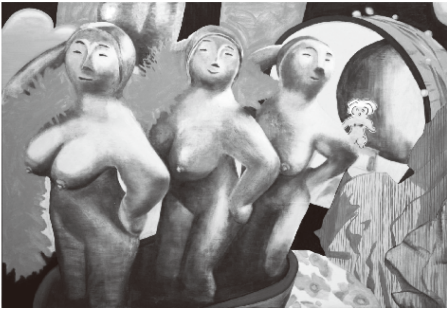
ITO Aya, Hole [2015] (partial)