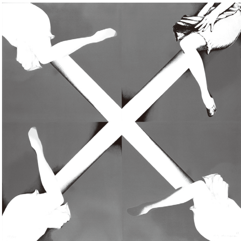
▲ YOSHIHARA Hideo , Seesaw 1, lithograph and etching on paper [1968]