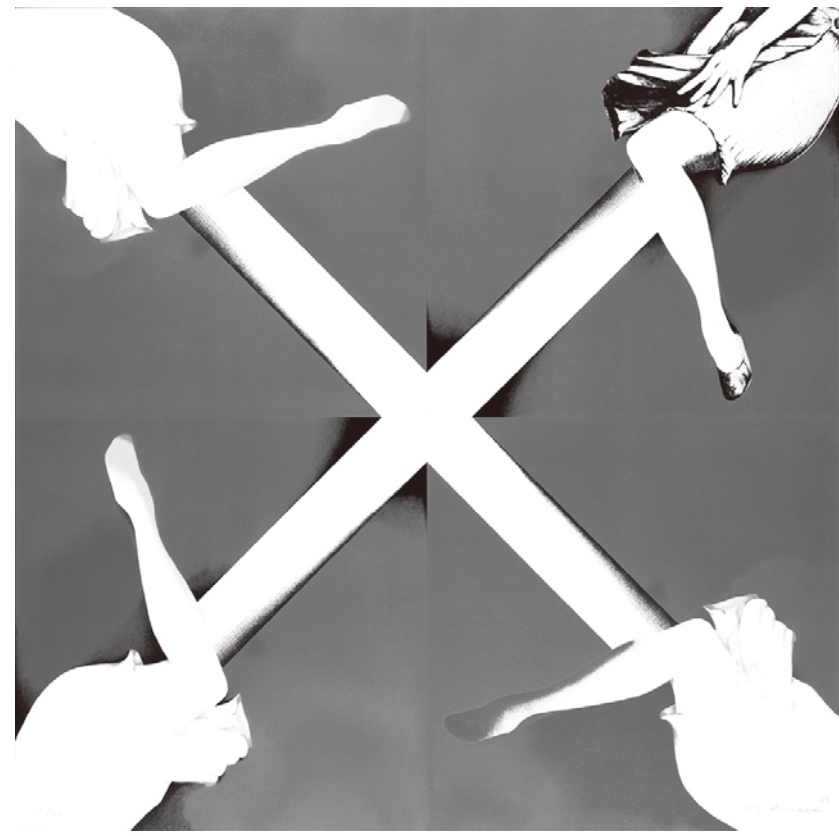
▲ YOSHIHARA Hideo, Seesaw 1, lithograph and etching on paper [1968]