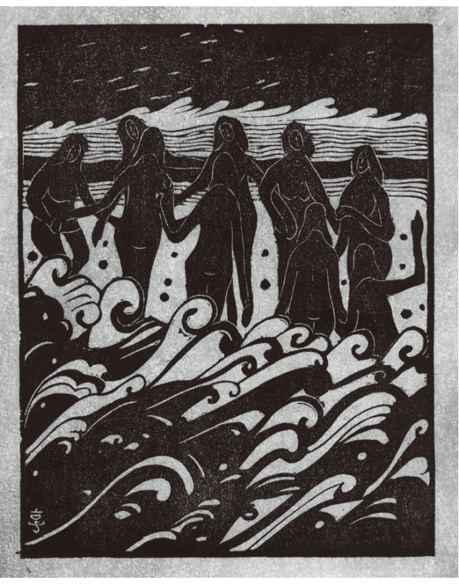
A Group of Happy Women Divers, 1919, Woodcut on paper