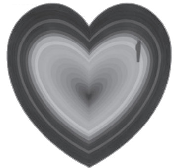
▲ Ay-O, Broken Heart , 1968, silkscreen on paper