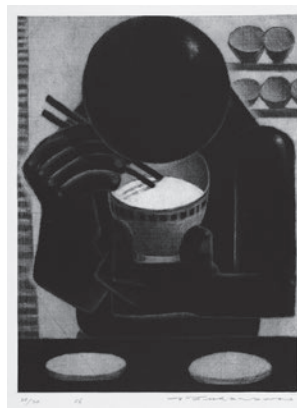
▲ FUKAZAWA Yukio, Meal , 1956, copper-plate print, paper