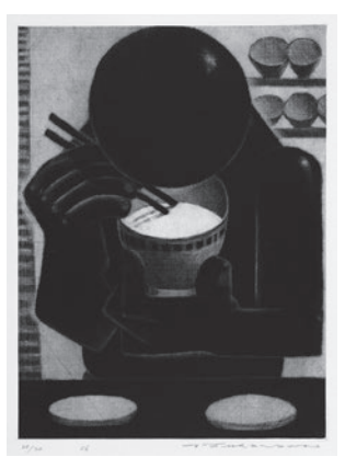
▲ FUKAZAWA Yukio, Meal, 1956, copper-plate print, paper