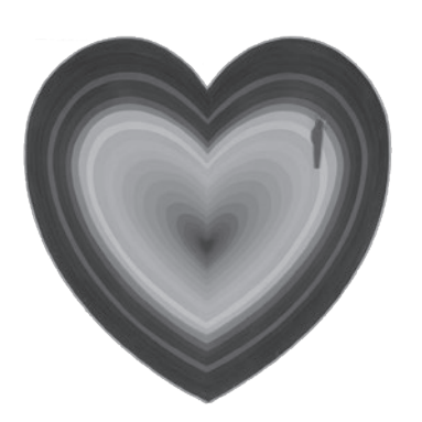
▲ Ay-O, Broken Heart, 1968, silkscreen on paper